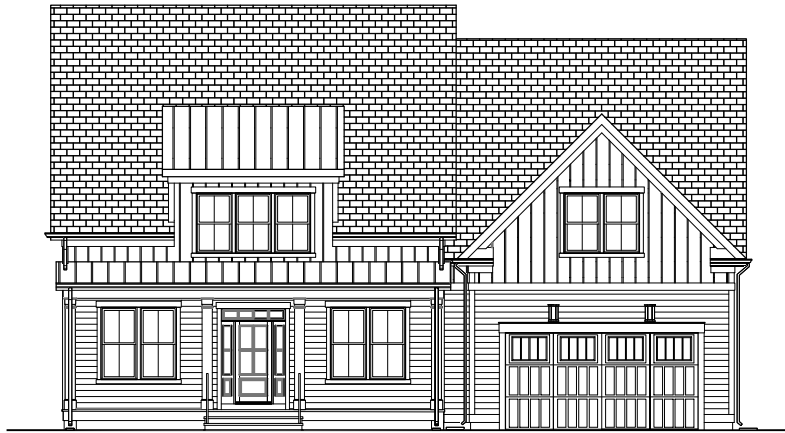
OPTIONAL SIDE ENTRY GARAGE AVAILABLE